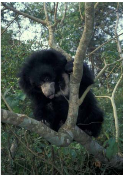
Sloth Bear, Nepal