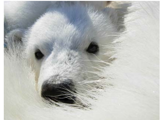
Polar bear: Andy Derocher

Local experts that can represent their countries on international wildlife conservation forums, like the polar