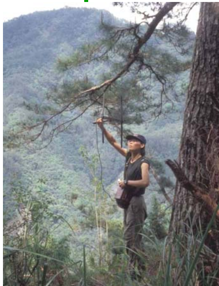
Tracking bears in Taiwan