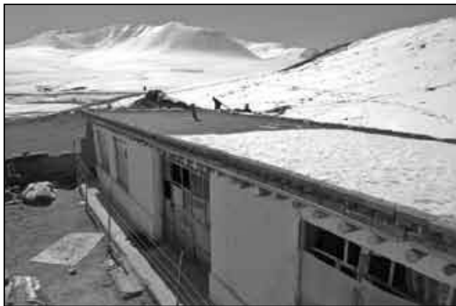
Trial installation of solar-powered electric fencing (SPEF) technology in Lari Village, Zhiduo County, in 2009