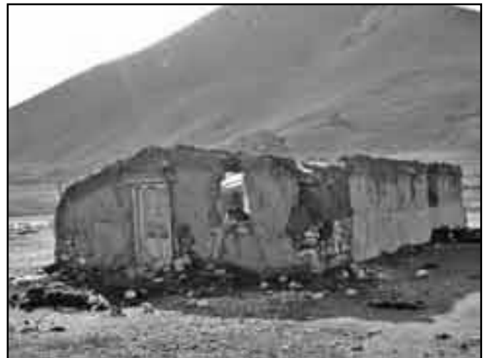
House destroyed by Tibetan brown bear

According to local herders, one of the most likely reasons for increased conflict with brown bear is a reduction in its prey species, most notably plateau pika ( Ochotona curzoniae ) due to a recent, multi-year, large-scale pika eradication policy (Hao 2008). Around 70 percent of the brown bear diet is comprised of pika (Xu et al. 2006). Even partial removal of pika from the grassland ecosystem would likely have serious impact on brown bear, leading to a forced shift in diet intake. Brown bear may thus have begun to search more widely for alternative sources of food, including entry into local herders' homes. Numerous other species also are affected by eradication of plateau pika, a keystone species of the plateau (Smith & Foggin 1999). An alternative reason why conflict with brown bear may have increased over the past few years is that they have increased in number, a possibility consistent with the removal of guns from herders around the turn of the millennium. Yet another reason for increased conflict could be that brown bear have learned and adapted their