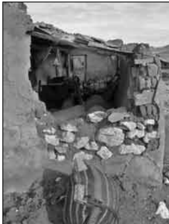
Wall broken by Tibetan brown bear

The homes under consideration are single story buildings, between 50-80 m 2 in area, with walls made from mud bricks, with metal or wood doors