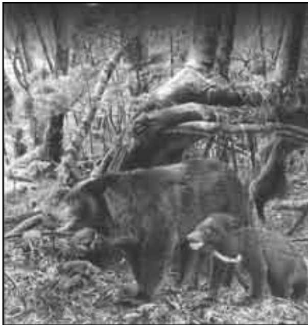
Artistry from Symposium abstracts (drawn by Shu-Fen Huang, Endemic Species Research Institute)

monitoring programs (e.g., camera trapping), where bear data are also being recorded incidentally. Some efforts are underway to distinguish individual ABBs in camera trap photos by their chest marking (akin to what is being done with tigers), but more commonly these photos are used only to differentiate black bears from sun bears, and generate an index of relative abundance. Kill statistics are routinely used to assess status of brown bears (e.g., Hokkaido, Russia), but are less commonly employed for black bears (which are legally harvested only in Japan and Russia).