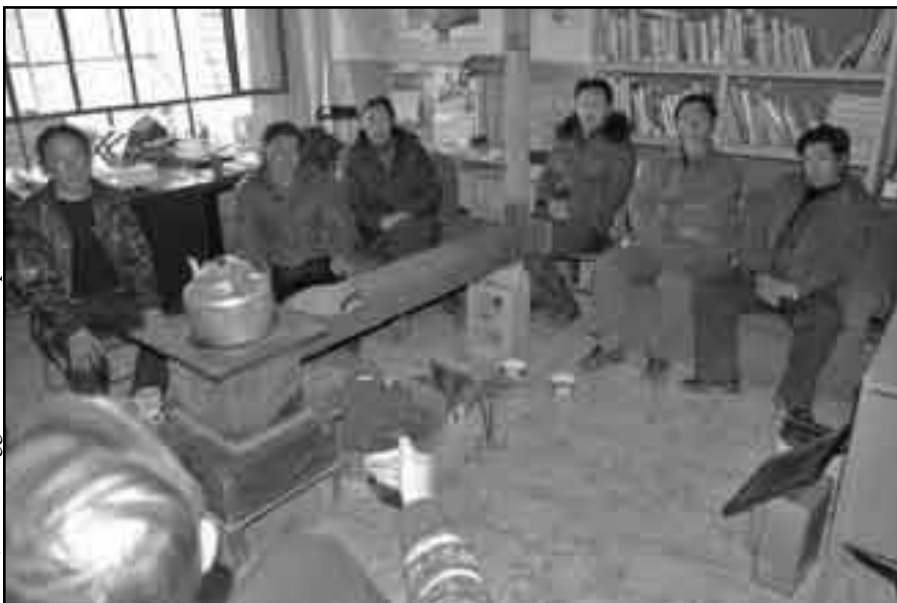
Workshop with local herders and nature reserve field staff on use and installation of solar-powered electric fencing (SPEF) and camera traps, 28 October 2009

contrast, during the same period, another house around 30 metres away was damaged by brown bear on at least two separate occasions. Likewise, according to the village leader, all 26 families in the village who had moved with their livestock to their summer pastures, leaving their homes unattended, also had their property damaged by bear while they were away (the village is comprised of 58 families in total). Damage to herders' homes by brown bear occurred throughout the village area between April and October 2009, with the exception of the trial home protected by electric fencing.