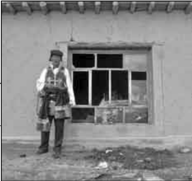
Window broken by Tibetan brown bear

behavior over the past decade or so, taking advantage of the occasional but significant food returns that can be obtained by breaking into herders' homes, i.e. 'warehouses' that did not exist before the government began to subsidize construction of winter homes (Foggin 2008).