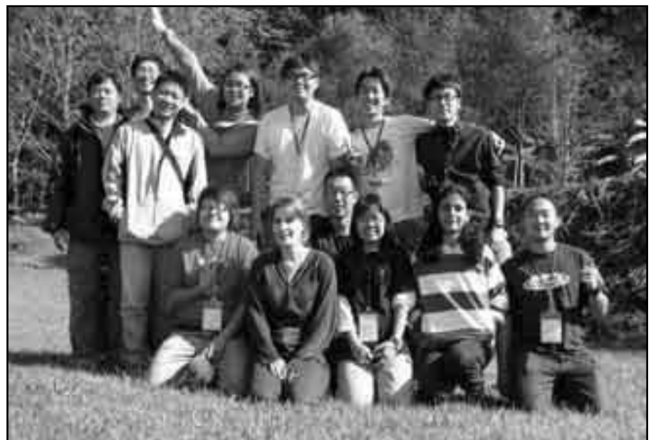
Training the next generation of ABB researchers and conservationists: graduate students involved in studies of Asiatic black bears who attended the Symposium and workshops.

Workshop participants considered and discussed how best to use the bears currently held in captivity at the