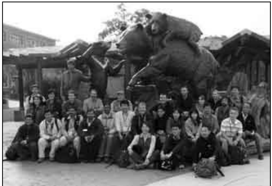
Participants of monitoring workshop at Endemic Species Research Institute, Taiwan

One option is to try to standardize all the various monitoring efforts to produce comparable results across the range. While seemingly ideal, this is not practical. Instead, we hope to encourage biologists to collect information on bears within the bounds of the various sorts of surveys already being conducted. Although monitoring methods naturally differ from project to project, temporal trends in bear populations can be observed by application of a consistent method over time within each individual monitoring site. The concurrent conservation activities carried out by these same projects, such as patrolling, and community outreach, should also benefit bears; thus, this initiative provides the