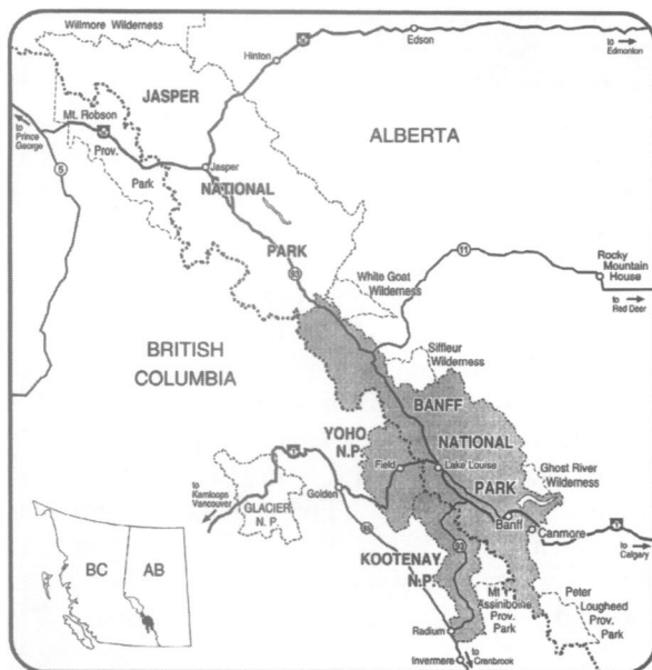
Fig. 1. Central Canadian Rocky Mountains. Banff, Yoho, and Kootenay National Parks are shaded.

The output from this routine is the habitat component for the effectiveness model. In essence, our habitat com-