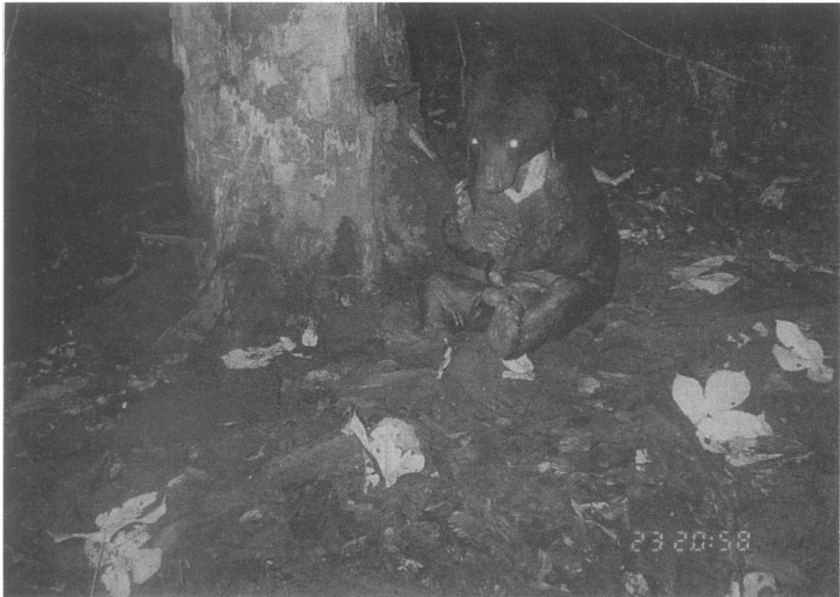
Fig. 3. A Malayan sun bear feeding on termite ( Dicuspiditermes spp.) mounds. Photo taken by the remote sensing automatic camera on 23 August 2000 at Ulu Segama Forest Reserve, Sabah, Malaysia.