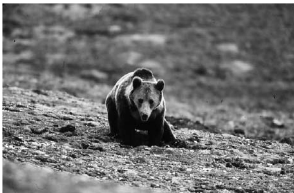
Fig. 3. A brown bear in the Qinghai–Tibetan Plateau digging for pikas, approximately 120 km east–northeast of the study area.

(Schaller 1985, Hoogland 1995, Smith and Foggin 1999). Plateau pikas are currently subject to extensive poisoning programs on the plateau and are considered by most government planners a rangeland pest (Smith and Foggin 1999). If pikas are extirpated from the plateau, it could have a major negative effect for brown bears. We suggest that the pika should be considered a positive element, and widespread poisoning activities to kill pikas should be halted.