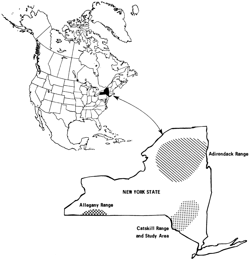
Figure 1—Location of New York State, Black Bear Ranges, and Catskill Study Area.

Etorphine (M99) and its antagonist Diprenorphine (M50-50) (Miller & Will 1973) were used for immobilization. Most bears were released at the trap site. A first upper premolar was extracted from each captured bear. Trapping was conducted from June to October in 1970 and from April through October in 1971 and 1973.